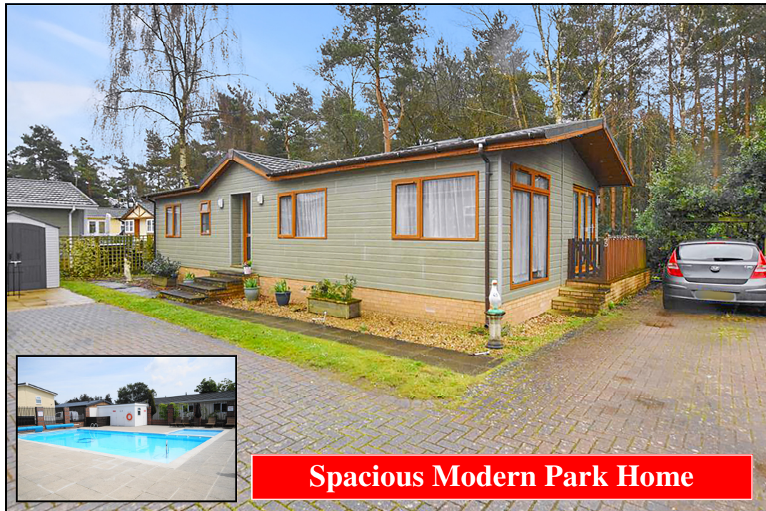
Spacious Modern Park Home

45 Tall Trees Park, Matchams Lane, Christchurch, Dorset. BH23 6TT